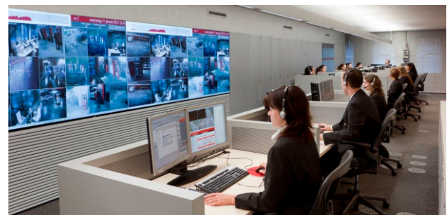
Figure 14: Q-Park Control Room (QCR) - 24/7 service

QCR will dispatch a Parking Host to assist at the location itself. For mechanical problems, the service department and service technicians can be called in to help.