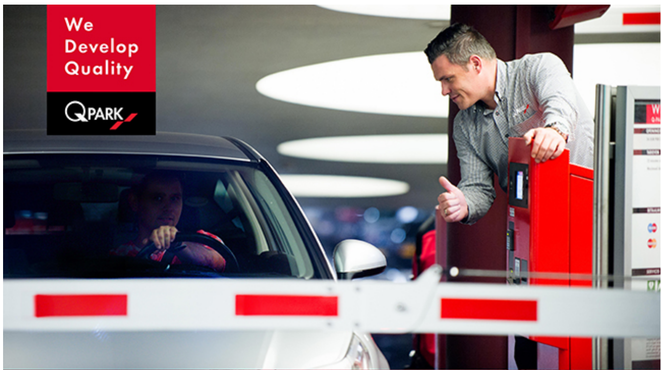
Figure 13: Parking Host on-site

In total we have 1,011 (2018: 962) parking facilities offering 24/7 services.