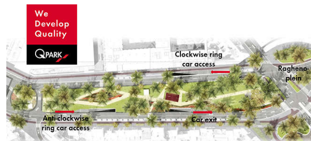
Figure 12: Bruul - Mechelen (BE)

The public space in squares and parks that are free of cars because parking is beneath the surface can be used by the local community for a wide variety of activities such as daily walks, weekly markets, monthly activities, as well as for annually recurring events such as music festivals and carnival parades.