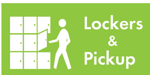
Figure 9: Mobility hubs with Lockers & Pickup points