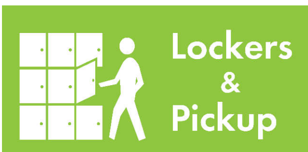
Figure 9: Mobility hubs with Lockers & Pickup points

Services increase accessibility and liveability include: