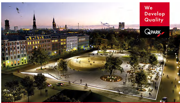
Figure 11: Israels Plads - Copenhagen (DK)

Off-street parking facilities reduce the amount of traffic searching for a place to park, which, in turn, has a positive impact on emissions and air quality in city centres.