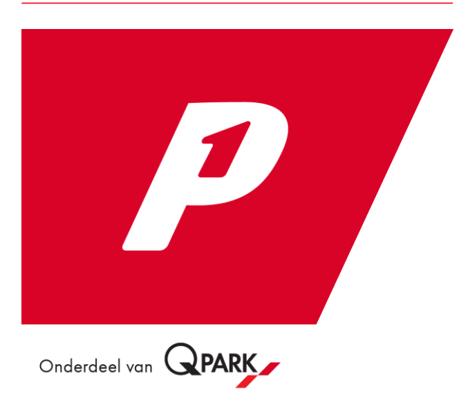
Figure 3: P1 acquisition in the Netherlands

Q-Park sees this as an opportunity to optimise service in the Dutch market and to engage with public and private stakeholders to build smart mobility solutions which will help keep Dutch cities accessible, liveable and economically viable.