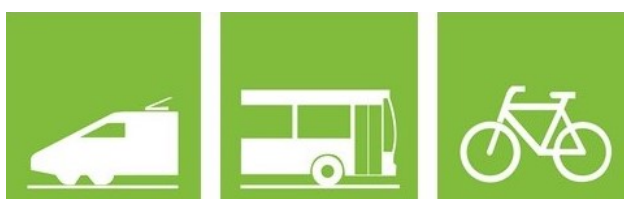
Figure 10: Proximity to alternative mobility options