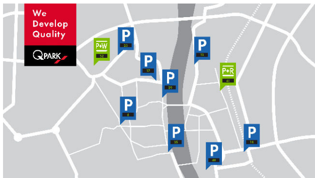
Figure 5: Economic access with P+R and P+W solutions

Even though municipalities throughout Europe are increasingly imposing restrictions on city centre access by cars, some access is required to be inclusive to all sections of society. Some visitors prefer to travel as close as possible to their final destination by car and are willing to pay for that service, others opt for a journey including Park+Ride or Park+Walk.