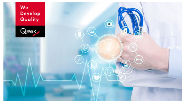
Figure 7: Diagnosing parking needs for hospitals