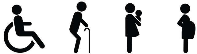
Figure 8: Inclusive mobility for PRMs

The availability of inner-city parking close to POIs is an essential service to enable PRMs to participate fully in society and Q-Park is committed to providing this service.