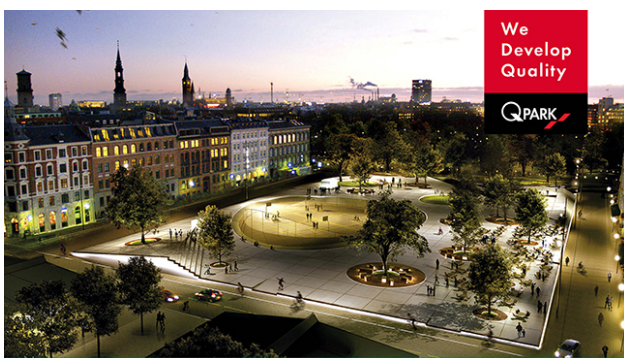
Figure 11: Israels Plads - Copenhagen (DK)

Off-street parking facilities reduce the amount of traffic searching for a place to park, which, in turn, has a positive impact on emissions and air quality in city centres.