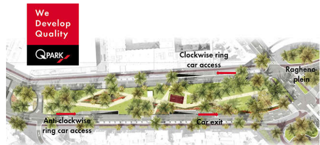
Figure 12: Bruul - Mechelen (BE)

The public space in squares and parks that are free of cars because parking is beneath the surface can be used by the local community for a wide variety of activities such as daily walks, weekly markets, monthly activities, as well as for annually recurring events such as music festivals and carnival parades.